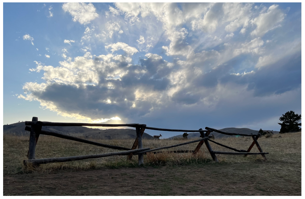
Raptorthon draws to a close...