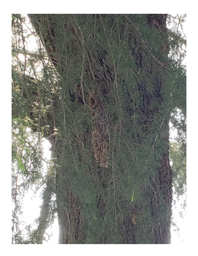
Bushtit nest out at the River Center!

The third stop of the day was the River Center, just north of Fresno. At this location, the raptors were not shy about making their presence known! We found nesting American Kestrels and Cooper's Hawks! We also observed two Sharp-shinned Hawks, six Red-tailed Hawks, one Bald Eagle, one Red-shouldered Hawk, and a dark morph Swainson's Hawk! Also at this location, we found numerous active nests, including Tree Swallows, Bushtits, and Black Phoebe.